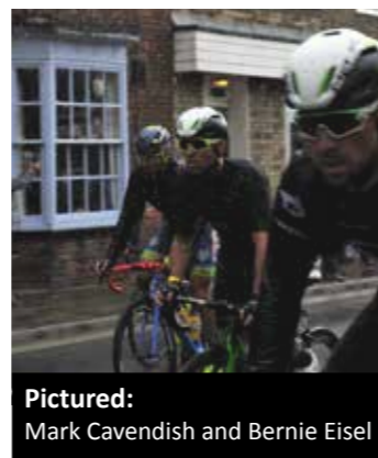
Pictured: Mark Cavendish and Bernie Eisel