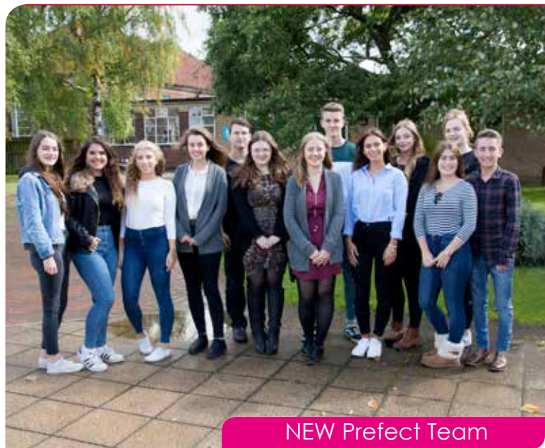
NEW Prefect Team

MCA 6 is in the top 10% nationally for PROGRESS